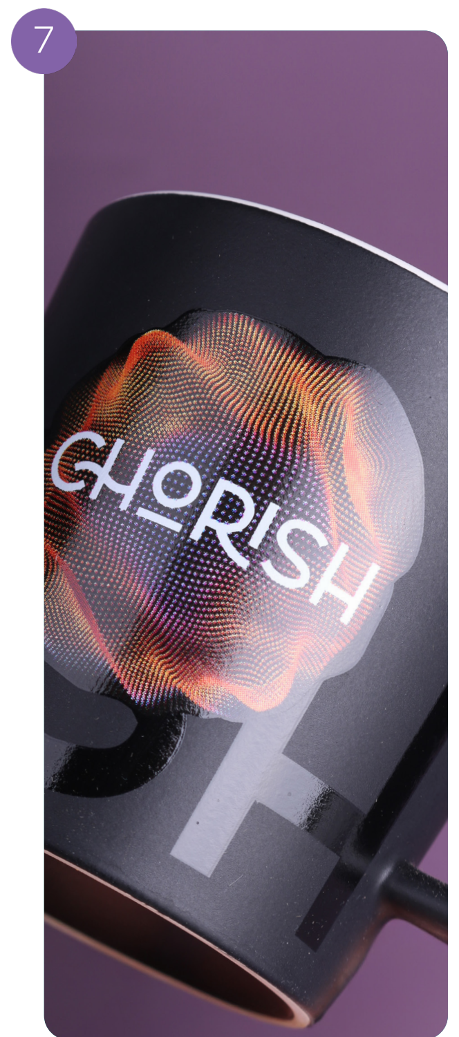
Organic decal decoration around the edges (CMYK + 1 Pantone color)