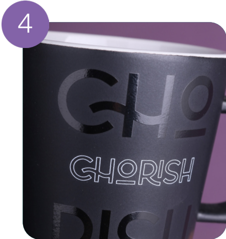
Print on one side (2 colors)