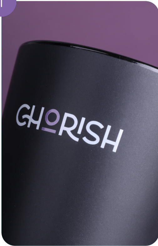
Interior coloring and print on one side of the mug (2 colors)