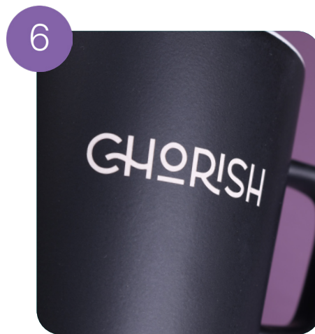
Laser Engraving (plate engraving*)