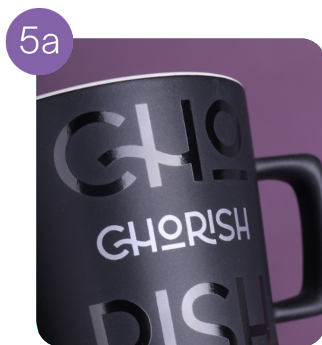
Print on one side (silver-like + black)