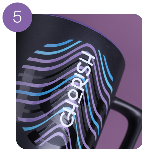
Full-surface mug print + handmade (5 colors)