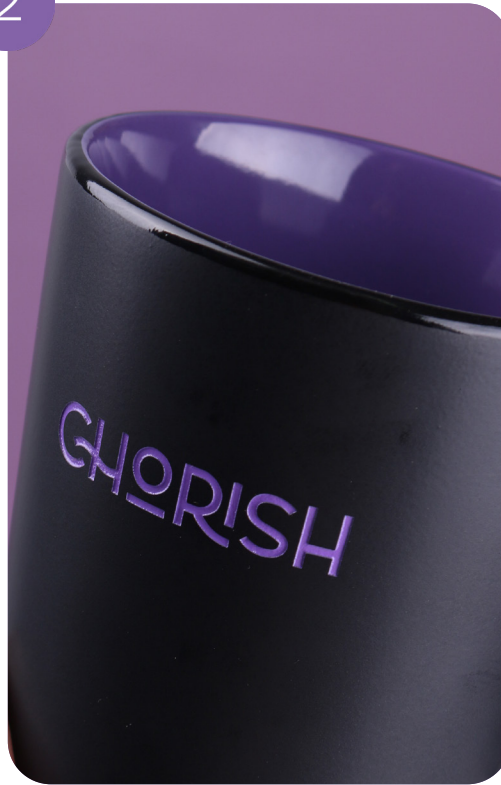
Interior staining and sandblasting (deep engraving) with color fill