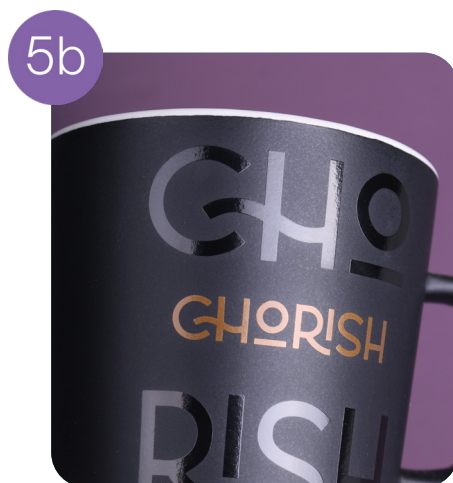
Print on one side (gold-like + black)