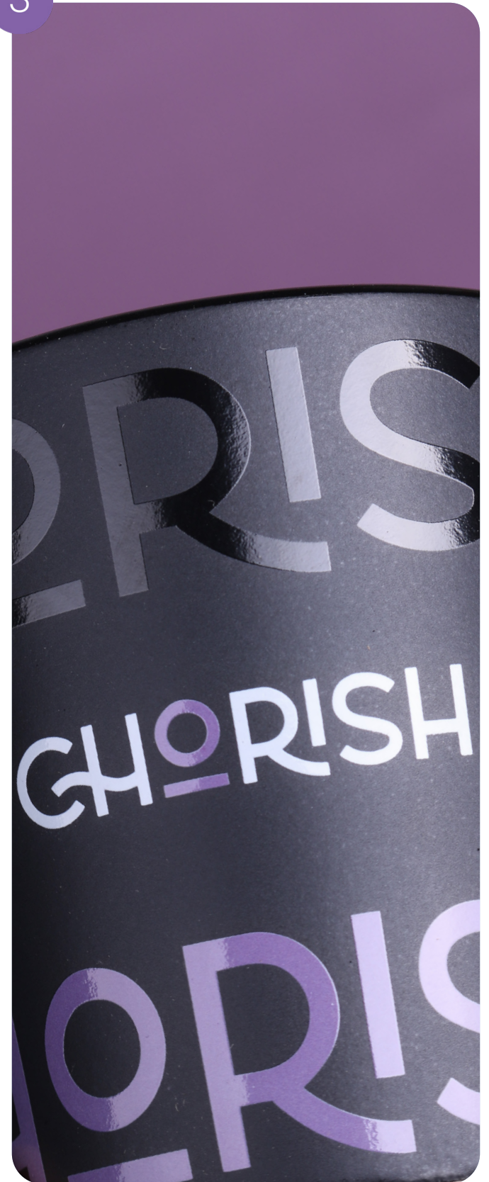
Interior coloring and decal printing around the mug (3 colors)